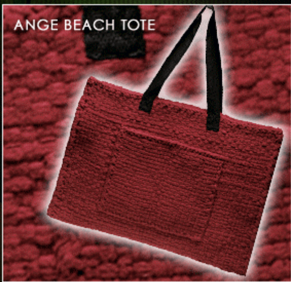
ANGE BEACH TOTE